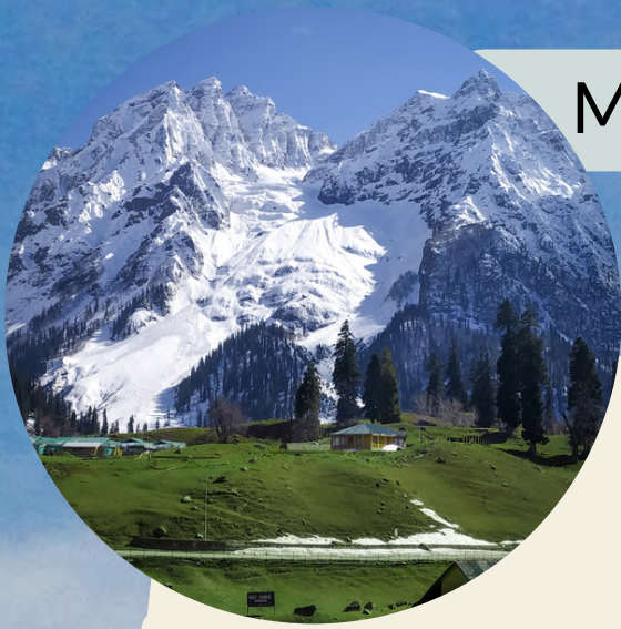
Mountains in Kashmir 4