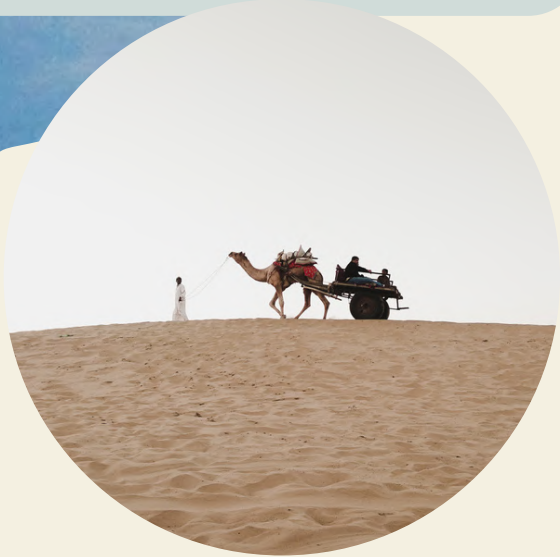
2 Thar Desert, Rajasthan