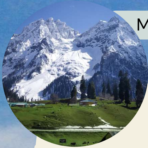
Mountains in Kashmir 4